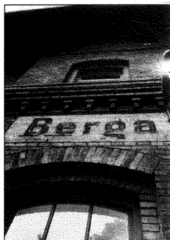
BY CHARLES GUGGENHEIM

The train station where the American prisoners arrived.